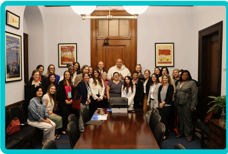
Pennsylvania Senator John Fetterman (top middle) with leadership from child advocacy centers across Pennsylvania.

across Pennsylvania had the opportunity to meet with Senator John Fetterman to advocate for his support to the Victims of Crime Act Fund (VOCA). The VOCA fund is crucial to the operations of child advocacy centers. Together we discussed the anticipated cuts to VOCA and the best plan of action to continue supporting what we do.